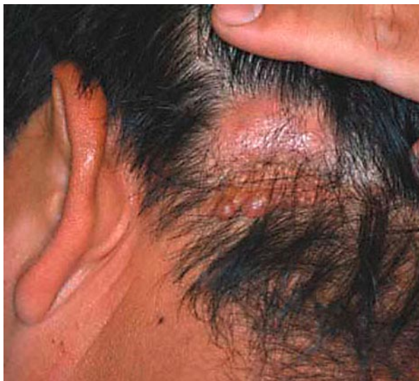
Fig. 1. A skin-colored, well-demarcated tumor located on the left side of the occipital region.

There authors have no financial interests to disclose.