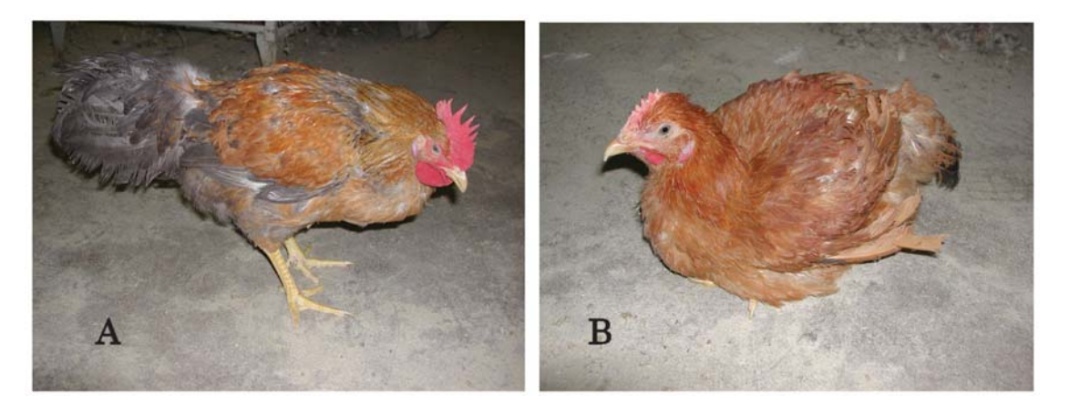
Fig. 2. Type-I progeny: A: male, B: female. Phenotype of these type-I chicken was similar to NH-413 strain.