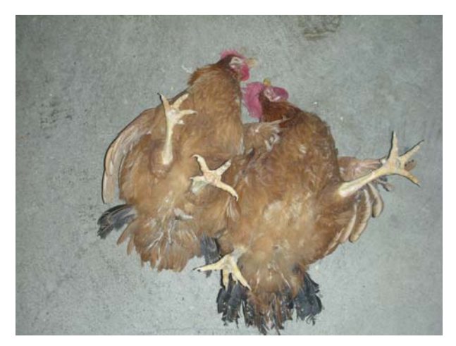
Fig. 3. Offspring by mating type-I male and female.

Sever symptoms of the muscular dystrophy in male (right) and female (left) offspring was also just same as that of the original NH-413 strain. After sexual maturity these chicken hardly fell down very easily. Complete regeneration of the muscular dystrophy chickens was achieved.