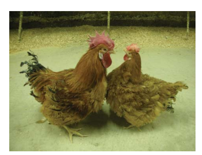
Fig. 1. NH-413 strain (since 1976 in NIBS). The chickens has symptom of Muscular dystrophy disease. Therefore, conventional breeding and maintenance are very difficult.