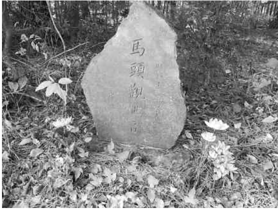
Fig. 2 The tomb in appreciation of the horse's spirit at the Education and Research Center of Alpine Field Science of Shinshu University in the Minamiminowa village.

The system enhanced the purchasing power of brokerage businesses, because the carriers had paid deposits as liability insurance to the owner of goods. Furushima (1974) also pointed out that the rules were activated by the commercial activity among villages in the Ina valley. Miyashita (1988) emphasized that the buying capacity of brokers was increased by the system and affected many goods, including the following list: cereals, sake, sugar, kuzu starch, silk, agar, tobacco, drugs, Japanese sandals, ramie ( Boehmeria nivea var. nippononivea ), hemp ( Cannabis sativa ), perilla oil seed ( Perilla frutescens var. frutescens ), paper, Japanese ink, fish, cotton, lead, fish sausage, incense stick, candle, umbrella, paper fan, tea,