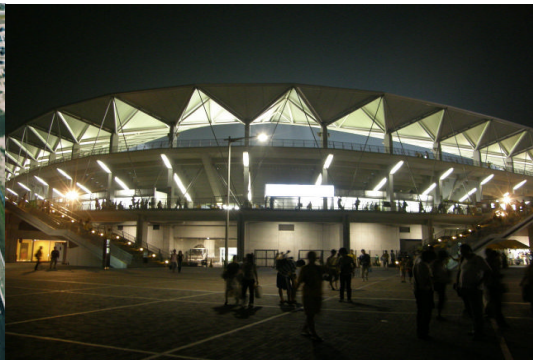
Figure 3. Fukuda Denshi Arena at night

The Fukuda Denshi Arena (originally named Chiba City Soga Football Stadium = Chiba-shi Soga Kyūgijō ), known as “ FUKU-ARI ,” was constructed in Chuo-Ku Chiba –city(Figure 1), Chiba prefecture. JEF United Ichihara Chiba football club (nickname: JEF Chiba, or JEF) of J. League uses it as a home stadium at the moment. The facility is owned by Chiba city and operated by Shimizu-group & Toyo Green. It has 18 500 seats, and space for 1 281 people to stand. Thus, its full capacity is 19 781. Fukuda Denshi, a medical electric instrument manufacturer, won the naming rights outbidding several other candidates. The location is a former Kawasaki Steel factory site. It takes 45 minutes from Tokyo Station to Soga station which is the nearest for “ FUKU-ARI ” (ten minutes on foot) by JR Keiyo line. Construction cost is 8,000 million yen.