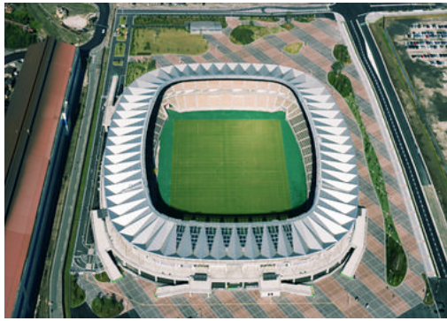
Figure 2. Fukuda Denshi Arena