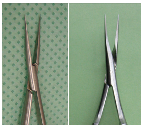
Figure 3: Close-up of the tips of Mizuho (left) and Muranaka (right) needle holders

holders in both hands to perform bypass surgery, no exchanging of the instruments is necessary to make stitches and tie threads [Figure 1d]. A surgeon also makes stitches in nondominant hand.