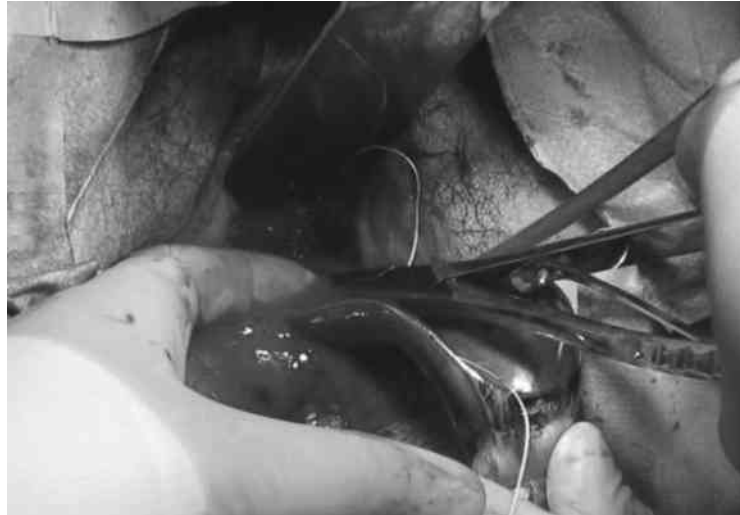
Fig. 2 A large amount of vaginal bleeding and vulnerable vaginal wall hamper observation and suturing.

of bleeding and number of pieces of gauze necessary for hemostasis were reduced on each subsequent hemostatic procedure. This was possibly due to a reduced blood supply around the vagina in association with involution of the uterus.