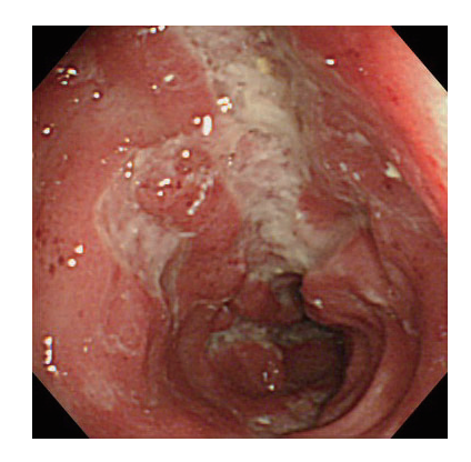
Figure 1. Small-bowel endoscopy demonstrates longitudinal ulcers typical of Crohn's disease.

On admission, physical examination showed cervical tenderness along the left common carotid artery and decreased pulse pressure in the left radial artery. Blood pressure was 98/63 mmHg and 80/0 mmHg in the right and left brachial arteries, respectively. Her body temperature was 36.6°C, and there was no bruit in any part of her body, including the neck and left subclavian area, or abnormal findings in the