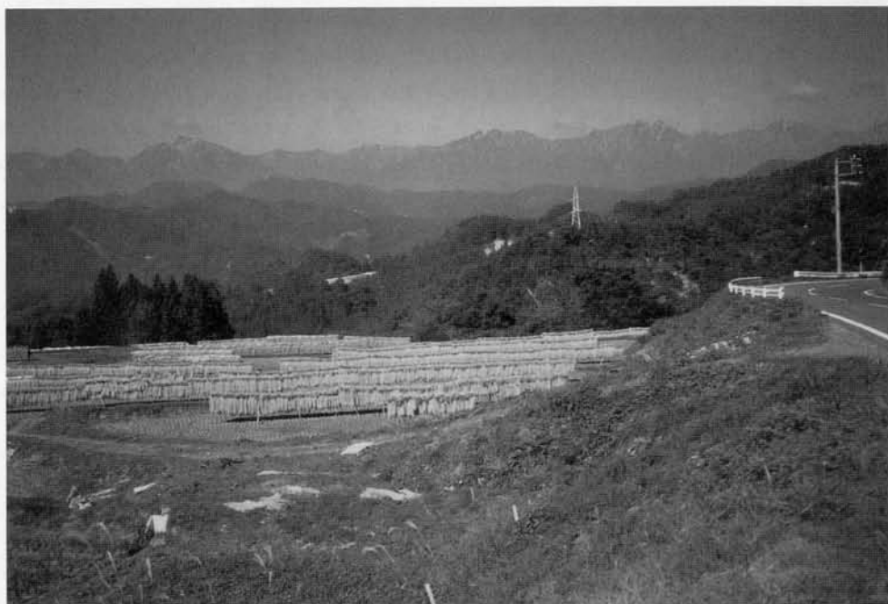
Fig.4 Skyline of Mt.Renge, Mt.Jii, Mt.Kashimayari and Mt.Goryu, from the left to the right. October 2000