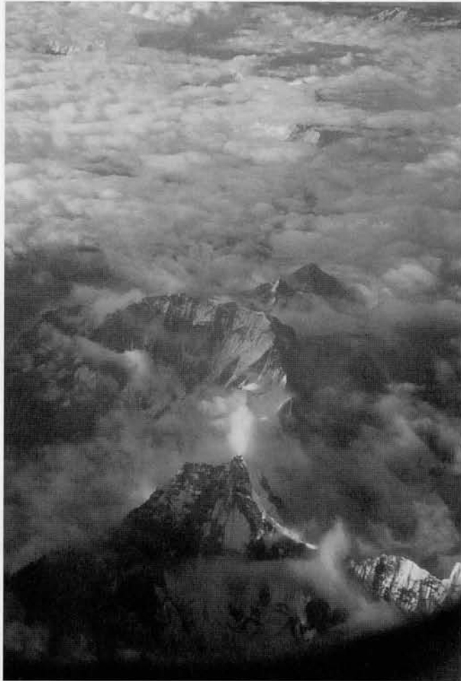
Fig.2 View from the regular airline service after Chengdu airport departure 1 hour, flying over Hengduan Shan, by author, August of 1998. Several sharp tooth-like horns can be seen soaring above expanse of cloud.

Above two pictures were taken by author on the regular service airline between Lhasa and Chengdu, in August 1998. Mountains in the picture were eastern extended portion of Himalayas, the Hengduan shan. Even today there are many unexplored peaks in the Himalayan Range including Hengduan shan (中村,1996). There are lot of dangerous points deep in those mountainland. Still today mountaineerings itselfs are very risky works even be full equipped with varoius climbing instruments and under enough preparations. Thus mountaineerings are highly adventurous actions at the risk of many persons lives. So, it is widely accepted that the sucess of reaching the summit is, not only be honorable achievement but be obvious conquer and the victory over the wild nature.