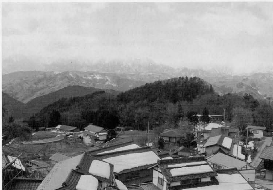
Fig.7 Far background is the Japan Alps being under heavy snowfall amidst winter monsoon. Middle ground is winter Saigawa hilly province. Foreground are farmland and settlement with remaining little snow. Picture is taken at the foothill of Hijiri mountain, February 2003, by author.

On the Hijiri mountain, located in the leeward side toward northwestern winter monsoon, it is given a little more sum of snowfalls than in the bottom of Matsumoto basin, so as dwellers can enjoy skiing although limited short duration. Fig.7 shows winter scene after a little snowfall. Melted snow becomes mountain groundwater through