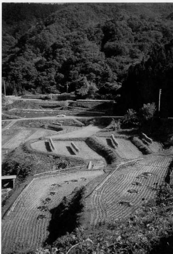
Fig.6 Rice terrace after harvest. On the northern foothill of Mt. Hijiri. October 2000, by author.

Those pictures were taken on the western slope of Mt.Hijiri located in the northern portion of Chikuma Mountainland which is extending north-south direction along the eastern border of the Matsumoto basin. Mt.Hijiri, altitude of 1,447 meters soar out on the Saigawa hilly province, being monadnock relief with volcanic rock having numerous small cracks, facilitating as rainwater reservoir. Lot of paddies has been opened on the foothills of Mt.Hijiri. Most of them take rice terrace forms. Fig.6 shows the landscape of