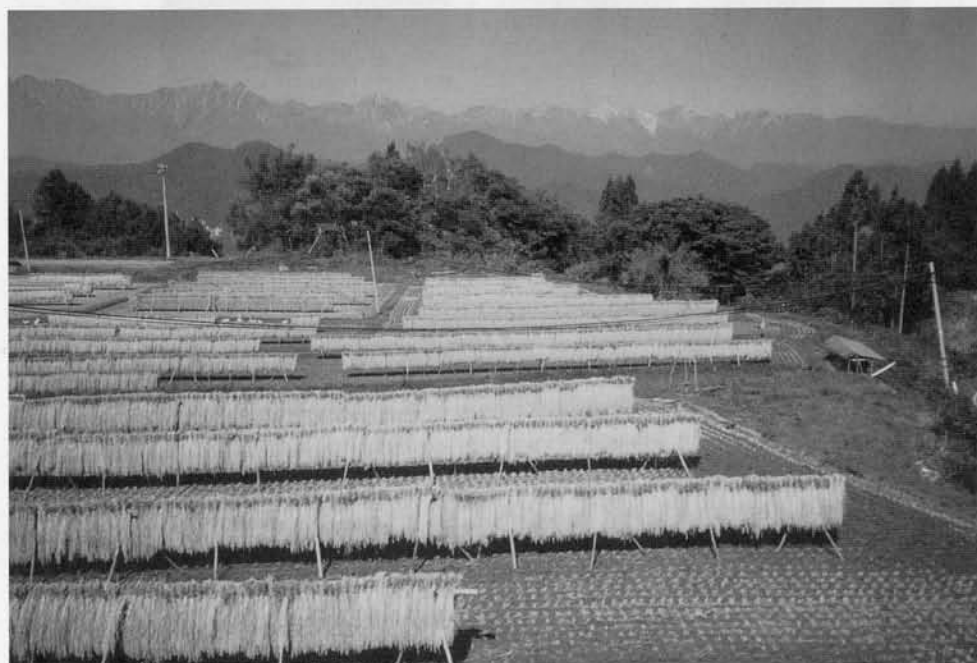
Fig.5 Skyline of Hakuba Mts. In the foreground harvested ripen rices are arranged for sun-drying. Paddies are on the rice terrace. October 2000, by author.