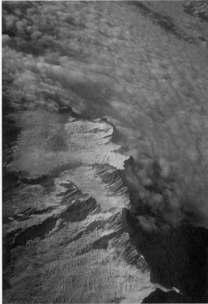
Fig.1 View from the regular service airline between Lhasa and Chengdu, flying over Hengduan Shan, by author, August of 1998. Valley glaciers and bowl-shaped cirques can be seen clearly.

Where two cirque walls intersect from opposite sides, a jagged knifelike ridge, called an arete , result. In Fig.2 sharp and steep ridges intersected on the ridge too. Where three or more cirques grow together, a sharp-pointed peak is formed by the intersection of the arettes . Such peaks are called horn . In Fig.1 and Fig.2, it is easy to find also such horns. Comparing with Japan Alps to be described later, it is obvious those glacier eroded mountains had and has been exposed far extent to wilder and more violent natures than that of Japan. For the long time people could not access to those mountains because the mountain natures had far surpassed human abilities. People had believed that various and many devils surely might hide behind in depth glacier eroded deep invisible mountain corner.